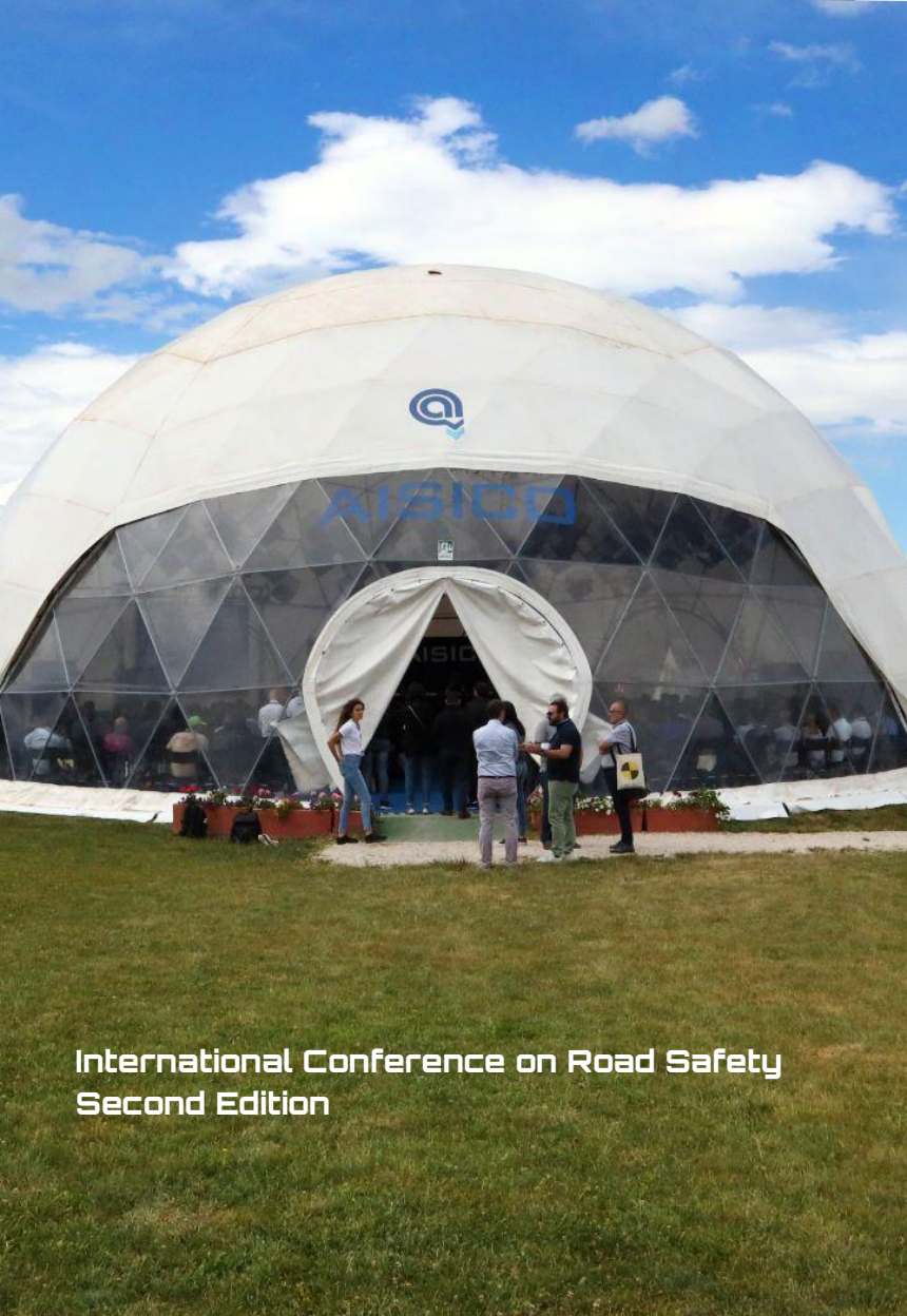
International Conference on Road Safety Second Edition